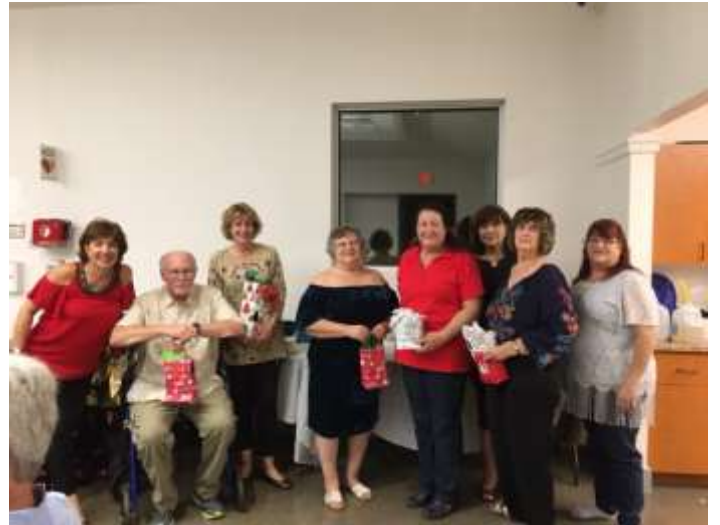
2021 Board of Directors