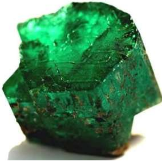
Gem experts say the emerald yielded at a North Carolina farm may be the biggest ever uncovered in North America.

A rare massive gem found on a farm in North Carolina could be worth more than a million dollars and tells an interesting geological history of The Tarheel State. The 65-carat emerald was unearthed in the rural community of Hiddenite, about 50 miles Northwest of Charlotte. Gem experts say the emerald, dubbed the Carolina Emperor, could be the biggest ever discovered in North America.