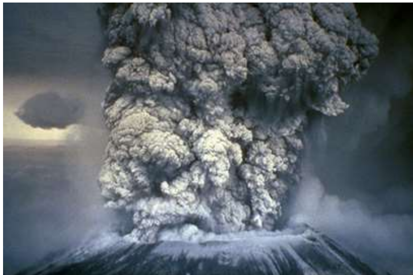
Kilauea (Halema'uma'u Crater) 18 May 1924 Eruption

While searching the Internet I found an article on an explosive eruption of Kilauea that caused damage in the Hilo area of Hawaii. That explosive event occurred 94 years ago also on 18 May back in 1924. Unlike Mt. Saint Helens, the ash from Kilauea was from hot lava that came in contact with underground water forming steam that caused the lava to be ejected into the air. Along with fine sand size particles there were boulders some weighing 8 -10 tons thrown 0.6 miles from the volcano. The East Rift Zone opened all the way to the coast about 20 miles South-East of Hilo. The 1924 eruption was from the largest of Kilauea's craters, Halema'uma'u.