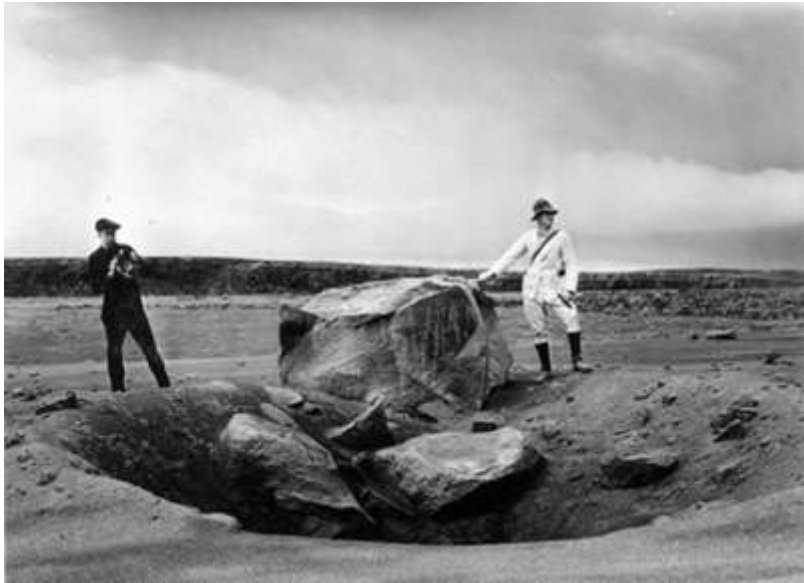
Kilauea 1924 Eruption – Large Blocks 8-10 Tons

SEE THE BELOW WEB SITES FOR MORE INFORMATION ON BOTH VOLCANOES: