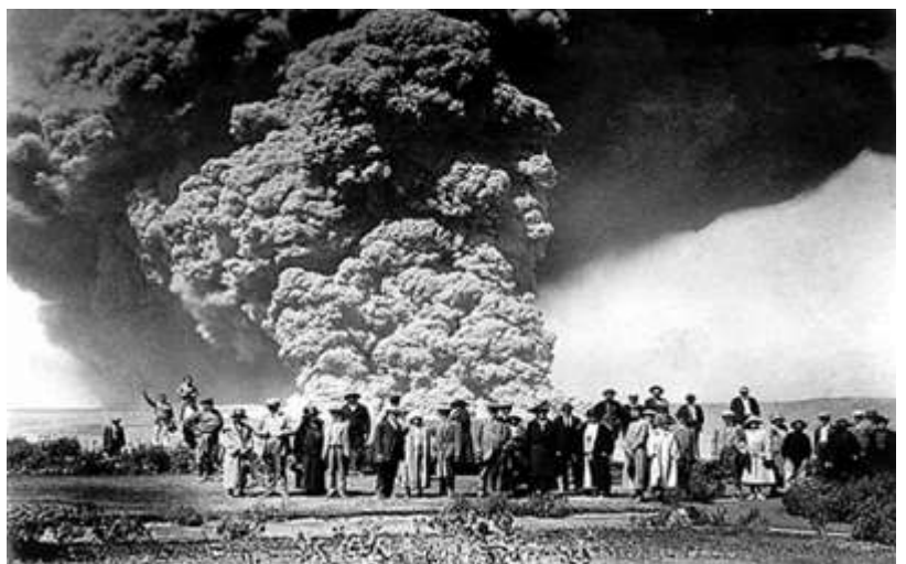
Kilauea (Halema'uma'u Crater) 18 May 1924 Eruption

The present day eruptions that are occurring at Kilauea are similar to the ones that occurred back in 1924. Kilauea is not the only Hawaiian volcano that is active; Mauna Loa, also on the Big Island, last erupted in 1984 with a record of 33 eruptions since 1843. The volcano Haleakala on Maui last erupted in 1480 and 1600 and may erupt again in the future.