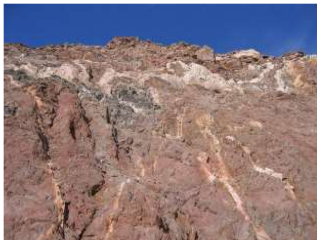
"Canyon Sin Nombre," Anza-Borrego Desert State Park, CA

Remember to go with your club or family on field trips, they're the most fun, and start looking around for something that you think will look beautiful. Whether it is drilling a hole into a seashell and pulling string through it so that you can wear it around your neck, or taking lapidary classes, shaping and polishing your first stone, use your imagination. Some people will say that imagination is God's way of letting you share your inner feelings with people around you. There is no right stone or wrong stone. It is up to you to express yourself through the stones that you pick with jewelry.