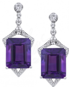
Earrings by Supreme

The amethyst is not only the February birthstone, it is also used to celebrate the 6th and 17th year of marriage.