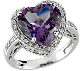
Ring by Stuller

It has been associated with many myths, legends, religions, and numerous cultures. Some historical accounts say that Saint Valentine had an amethyst ring carved with an image of Cupid. And for those familiar with Old Testament history, amethyst was one of the twelve gemstones that represented the twelve tribes of Israel.