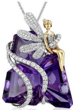
Pendant by Yael Designs

Amethyst, as previously mentioned, is composed of quartz, which is the second most abundant material found in the Earth's crust. Amethyst gets its color from irradiation, iron impurities and the presence of trace elements. Its hardness (a 7 on the Mohs scale) is the same as other quartz, which makes it a durable and lasting option for jewelry.