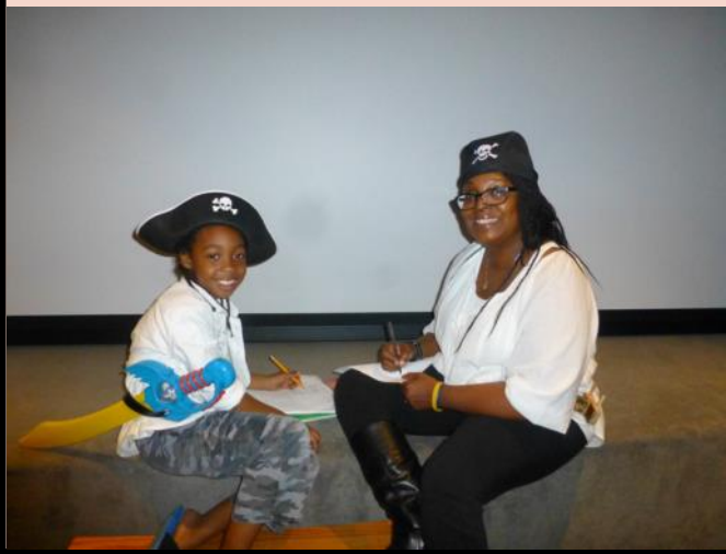
Homework before treasure hunting!