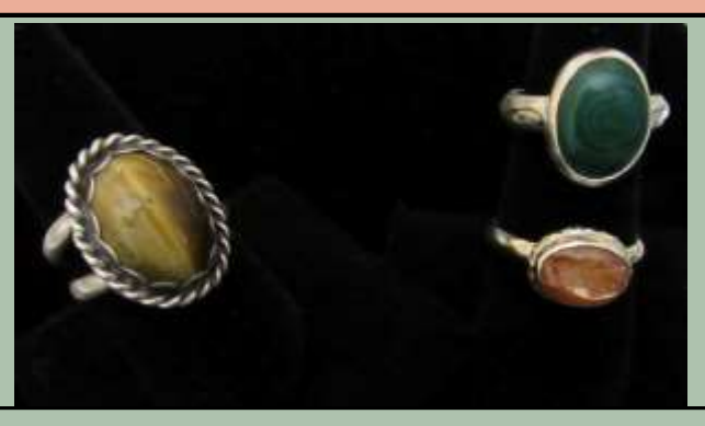
Basic Metalsmithing Class Sunday, September 13<sup>th</sup>, 2015 10 AM – 5 PM, GMSPB Shop

Class: $50, Materials: $30 for Copper, or $60 for Silver Instructor: Laura Simmons Please RSVP to Laura@AstralisArts.com